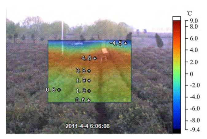
Figure 10 Infrared thermal image of the area protected with VBF