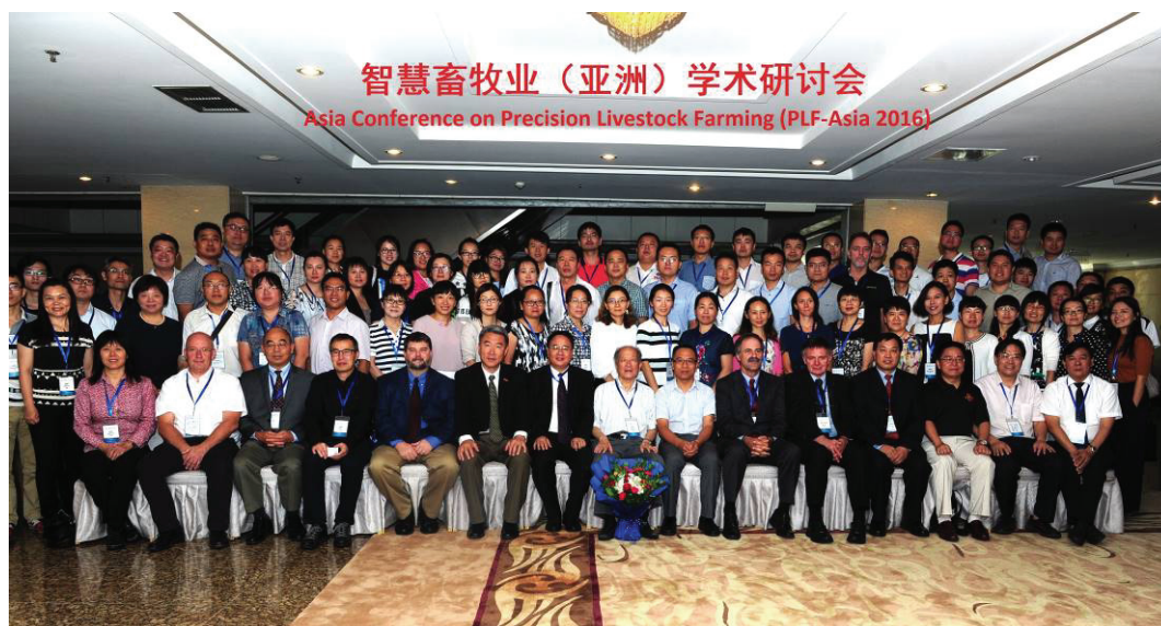
Group photo of PLF-Asia 2016 participants