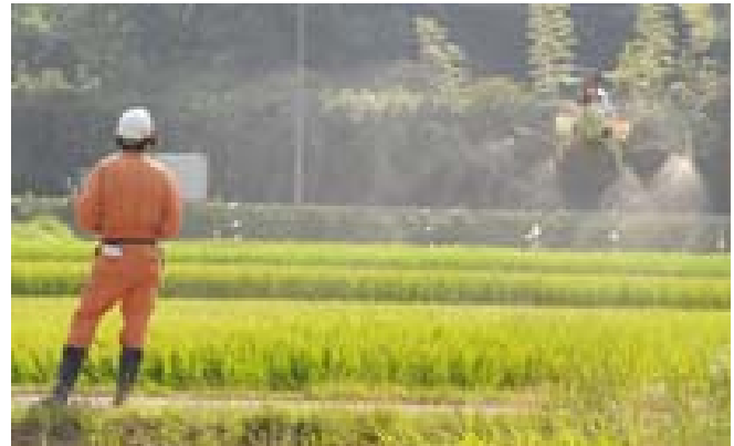
a. Project field trails using YAMAHA 1880 UAV in Japan in 2012