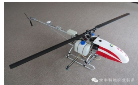
a. 3WQF80-10 (Quanfeng, Anyang)

eight-rotors battery power UAV were tested using this method in 1 hm 2 wheat field and the effects of flight direction, flight parameters and crosswind on the distribution of spatial spraying deposition quality balance and the downwash flow field distribution were researched. The test results showed that regardless of the flight direction and height and the crosswind, all these factors influenced the droplets deposition distribution via weakening the intensity of the downwash airflow field in the direction perpendicular to the ground.