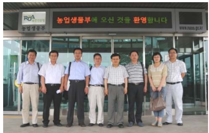
b. Project meeting in Seoul in 2013