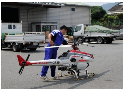
b. Newest model 'R-Max 3880' in the process of launching in Japan in 2015