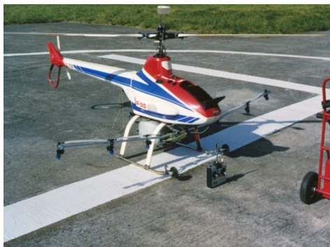
a. Yamaha's first generation petrol-powered agricultural UAV in Japan: Model 'R50'

Along with the continuous development of agricultural aircraft, Japanese aerial spraying technology made considerable progress. The volume of the tank increased from 5 L to 24 L, and the application rate developed from the original application rate of 30 L/hm 2 to a lower application volume of 5 L/hm 2 and finally to an ultra-low volume spraying of less than 1 L/hm 2 . Ultra-low volume technology has been well developed in Japan. The Yamaha's newest model 'R-Max 3880' invented in 2010 has equipped with two tanks of 12 L each mounted on the both sides of the fuselage, and the time required to fill two tanks is less than 1 min with simple operations of launching, controlling and spraying as shown in Figure 3b.