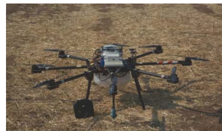
c. LHX8-3WD10 (Look Heed, Wuhan)