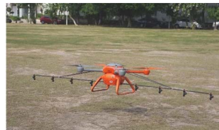
b. CG-Q60S (Crop Guard, Zhuhai)