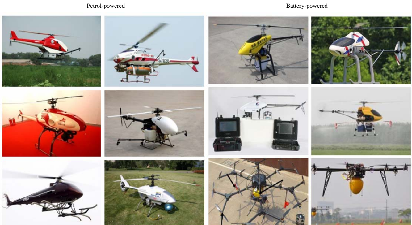
Figure 2 Typical UAV aircraft developed in China: 178 different UAV types for chemical application in China market in 2016 year from more than 200 manufactures

manufacturers and over 169 types of agricultural unmanned aerial vehicles for chemical application in Chinese market, having already conducted the work of the control of pest and disease in the fields of paddy, wheat, corn, cotton and sugarcane and in the orchard. The real effect proves that the UAV pesticide application meets the requirement of practical level and it is in a rapid development stage [28,52-54] .