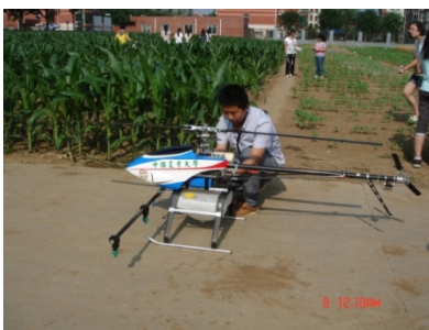
a. Single-rotor battery-powered UAV designed by China Agriculture University (CCAT) in 2010 with 10 L chemical liquid-tank (CAU-3WZN10A)

Chinese agricultural UAVs are divided into two types according to the structure: single-rotor UAV and multi-rotor UAV, and the power system can be divided into two types: motor and diesel, and there are more than 10 types of UAVs. The empty weight is generally from 10 kg to 50 kg, and the working height is from 1 m to 5 m, and the working velocity is less than 8 m/s. The kernel of electric power system is the motor, with the characteristics of flexible operation, rapid rising and landing and 10-15 min duration of flight. The key of diesel power system is the engine, so the diesel UAV needs a longer time of rising and landing because of poor flexibility and large fuselage, and this type of UAV's single flight time can exceed 1 h and the maintaining is more complex. The tank volume of single-rotor UAV is mainly 5-20 L and part of UAVs may achieve 30 L. The multi-rotor UAV mostly adopts the electric power system, with less loading than single-rotor UAV, and the tank volume mostly ranges from 5 L to 10 L. The multi-rotor aircraft has the features of simply structure, convenient maintaining and high stability, and the spraying efficiency can reach 0.2 hm 2 /min as shown in Figure 1 [1,25,40,42,46-51] .