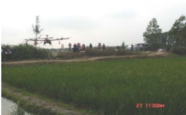
Figure 5 Evaluation of 13 kinds of Chinese UAVs in rice fields in Hainan Province in 2013

CCAT has evaluated 13 kinds of Chinese UAVs in rice fields in Hainan Province during January 2013. The test results showed that the 13 kinds of Chinese UAVs had an apparent biological control effect in paddy fields. Ministry of China has begun to generalize this UAV technology in China since then.