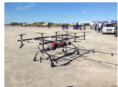
c. Sixteen rotors battery-powered UAV made in China with 30 L chemical liquid-tank (3WYR-30)