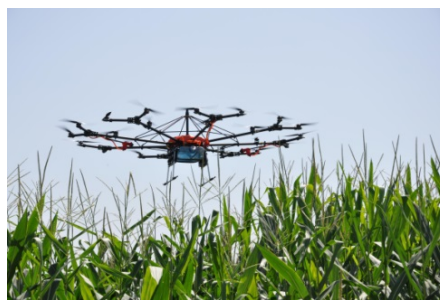
b. Eighteen rotors battery-powered UAV made in China with 15 L chemical liquid-tank (3WSZ-15)