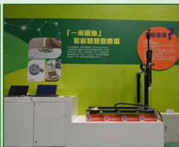
"One meter garden" —Smart family farming device