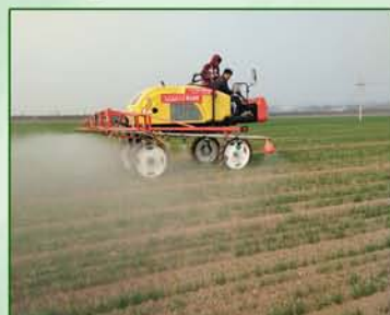
Field test of variable precision spraying machine

The lab has the large-scale specialized instrument equipment: the high speed photograph system, handheld laser scanning system (LTD706), the type virtual reality design system (LTD706), the island electronic tensile testing machine (AG-250X, data acquisition system (i2700), etc.