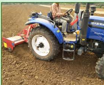
Field test of monitoring tilling depth of rotary tiller