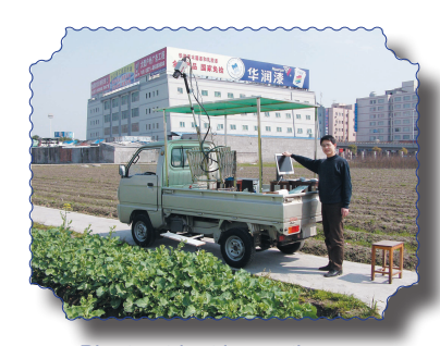
Plant nutrient inspection van

Technology, 2 first prizes and 8 second prizes of Zhejiang