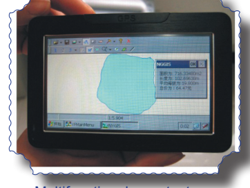
Multifunctional area teste