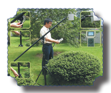
Plant canopy analyser