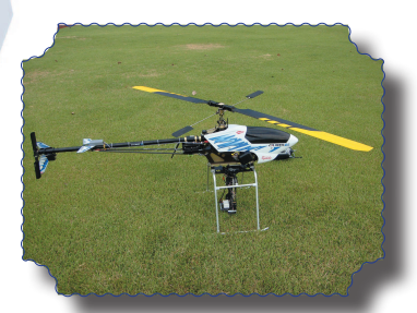
Agricultural pilotless aircraft