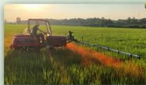
Standardized test of boom sprayer in rice-Hubei 2018