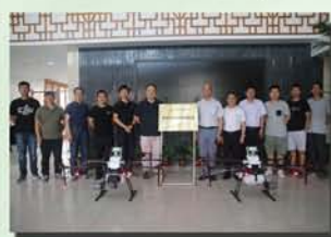
Establishment ceremony of CCAT-DJI cooperation lab-2018