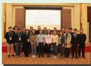
International Conference of Plant Protection Machinery and Application Techniques-Wuhan 2018