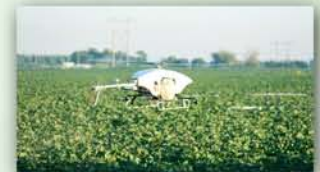
Pesticide application test of model 3WQF120-12 UAV in cotton field