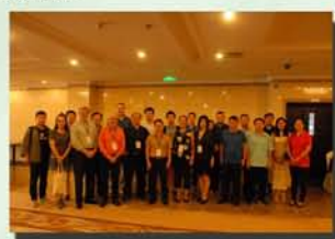
International Workshop of Drift and Anti-drift Technology-2017