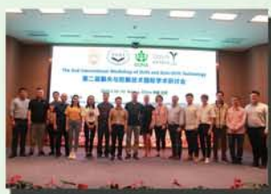
International Workshop of Drift and Anti-drift Technology-2019