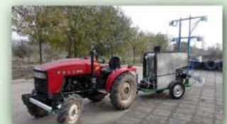
automatic profiling precision variable-rate orchard sprayer based on LIDAR detection