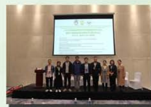
International Conference of Plant Protection Machinery and Application Techniques-Qingdao 2019