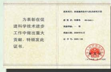
Ministry of Education Science and Technology Progress Award