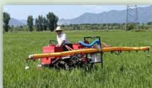
Self-propelled amphibious air-assisted anti-drift boom sprayer