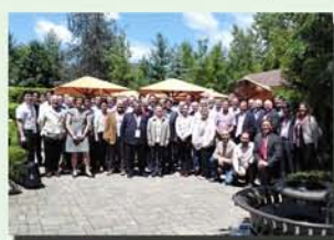
ISO-TC23-SC6 Canada annual meeting 2018