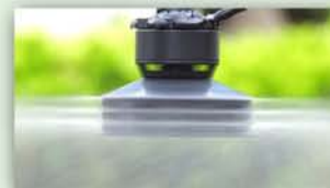
National Spark Program Project Certificate