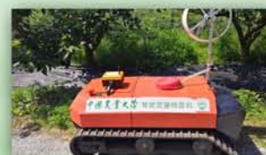
Autonomous navigation self-propelled crawler orchard sprayer