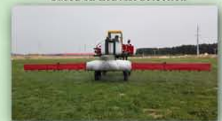
Self-propelled high clearance anti-drift boom sprayer