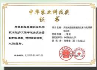
China Agricultural Science and Technology Award

The CCAT has published more than 100 scientific papers with 78 SCI/EI indexed and 9 monographs, obtained 19 invention patents authorizations, and participated in constitutions of international, national, regional and industrial standards. Up to now, the CCAT has successfully organized 7 sessions of 'International Workshop on Plant Protection Machinery and Application Techniques' since 2008 and 2 sessions of 'International Workshop of Drift and Anti-drift Technology'. The CCAT won the first prize of Agricultural Science & Technology Award of China in 2013 and won the first prize of Science & Technology Progress Award of Education Ministry in 2006. The CCAT has signed cooperation agreements with more than 20 domestic plant protection machinery or chemical enterprises. The CCAT also keeps long-term and close relationships with many universities and institutes from Germany, USA, UK, Denmark, Italy, France, Poland and etc. The students from the CCAT have the opportunities to visit these institutions for further training every year. International experts also come to China often for academic exchanges. The CCAT will continue to contribute to improving the safety and efficiency of chemical application in the future.