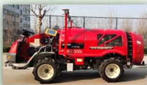
autonomous navigation self-propelled orchard sprayer