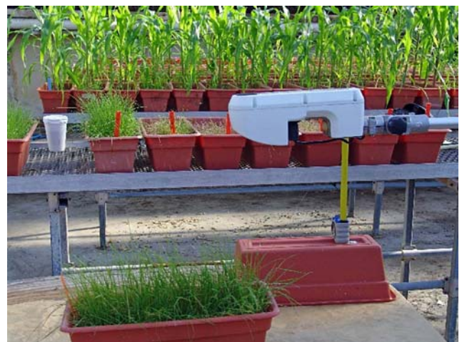
Figure 1 GreenSeeker optical sensor scanned over window boxes planted with ryegrass at various heights and orientations. The resulting NDVI values were automatically recorded to a PDA connected to the optical sensor.

A GreenSeeker handheld optical sensor (Model 505, NTech Industries, Inc., Ukiah, California) was suspended at five different heights (30.5 cm (12"), 61.0 cm (24"), 91.5 cm (36"), 121.9 cm (48"), 152.4 cm (60")) above 45.7 cm×19.1 cm (18"×7.5") window boxes (Model DCB18 TC, Duraco Products Inc., Streamwood, Illinois) planted with fourteen day old ryegrass (Figure 1). Six different window boxes planted with ryegrass were used for this study. Kraft paper was placed beneath the window boxes to provide a uniform background for the scans. The sensor was passed over each window box, parallel to the ryegrass canopy, five times at each of two orientations (Figure 2) and at a speed of 15 cm per second (6" per second). The resulting NDVI values were calculated from the red (660 nm) and NIR (770 nm) bands and automatically recorded to a personal digital assistant (PDA). All scans for the study were conducted within a 60 minute timeframe, thus ensuring minimal variation in ambient conditions. Since individual window boxes were situated over a uniform background and the light beam extended beyond the extents of the window boxes, only the maximum NDVI values for each