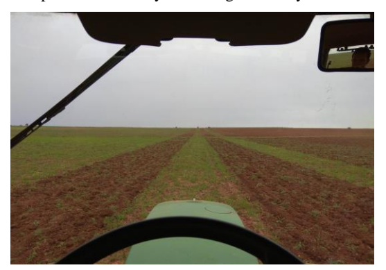
Figure 3 Pattern followed by the vehicle

In this case, a multi-constellation antenna (Tallysman 2710) similar to the one installed in the base station (Tallysman 3740) was mounted on the rover instead of using the Novatel Ag-start. A second U-blox NEO-M8T module was also necessary to be used on the rover. Finally, this was the option that has provided the best results, even after a weekend in between. This configuration assured the correct offset between adjacent passes, without overlapping and failures. Figures 3 and 4 show the pattern 7 km far from the base station after a weekend without working. It can be seen that the trajectory followed by the vehicle coincides with the pattern pre-established by the auto-guidance system.