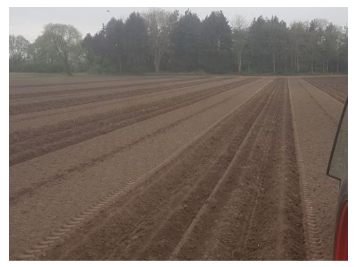
Figure 2 Field area where the experimental tests have been carried out

Real-time tests were carried out in Castilla la Mancha (Spain) on flat ground (38 °44'14"N, 3°0'53"W) to evaluate the reliability of the guidance system. Four different tests were carried out in order to find the configuration that provided the best accuracy. The more accurate the guidance system is, the more benefits are obtained mainly due to the lack of overlapping areas in each pass and less non-processed areas. Thus, less fuel is needed, fewer working hours are spent and less resource is wasted. In the tests, the reference was not always a straight line, since the field had a non-rectangular shape. In order to reduce the curvature at the end of each pass, the pattern left an intermediate work line between each pass (see Figure 2). The vehicle velocity was set to a constant value in all tests because the terrain was flat and homogeneous. Typically, the velocity was set to 4-5 km/h when ploughing or harvesting and to 12-15 km/h when fertilizing or spraying.