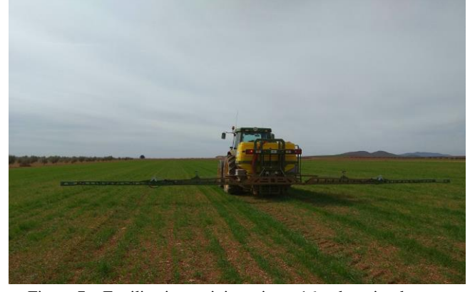
Figure 7 Fertilization activity using a 16 m long implement

back on when it re-entered an area that had not yet been sprayed. This automation is useful on point rows, curved rows, and even at the end of each pass. The reduction in overlapped/double-dosed areas saves fertilizers and pesticides, fuel and time, and operator fatigue. According to the auto-guidance program, this implied a reduction of 5% in fertilizers. 6 work hours and 3% in fuel were also saved using the auto-guidance system.