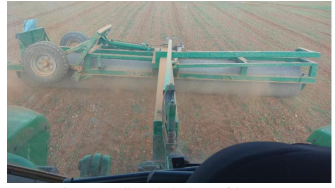
Figure 5 Roller at the back part of the tractor

The first activity consisted of smoothing the land to protect the seeds from adverse weather conditions (see Figure 5).