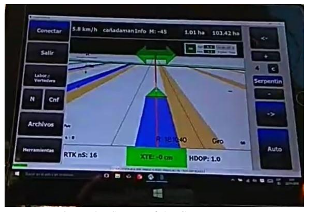
Figure 4 Screen of the Cerea program

The problem that has been found is the need to rely on the Internet for the use of these modules because it has not been possible to operate with them in the autonomous mode. The Novatel Ag-start has a correction data processor, which makes it possible to be used autonomously, while the Tallysman-Ublox set requires a source for processing corrections, the RTKLIB, which makes it difficult to be used autonomously.