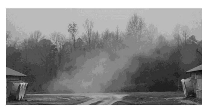
Figure 2 Air emission plume from a tunnel ventilated poultry house

example to investigate Gaussian dispersion model predictions of downwind concentrations under different case scenarios. As shown in Figure 2, although the emission "stack" of the housing ventilation fans was near the ground level (1.5 m above the ground), the exhaust plume may reach the top of the background trees (14 m high). The plume-rise of the air emissions from this animal housing system was caused by velocity momentum of the exhaust fans and the thermal lifting of the exhaust air due to temperature difference between emitted air and surrounding air. Thus, the plume-rise of air emission from animal housing system is a function of the exhaust ventilation fan flow rate and the temperature difference between the exhaust air and the ambient air. Consequently, the plume rise varies over different seasons and under different ventilation settings.