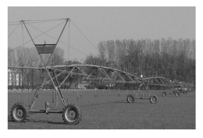
Figure 4 Synchronized control system of a linear move irrigator

positions of the linear move irrigation system examined in the field test.