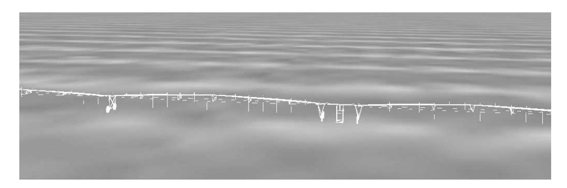
Figure 1 3-D models of a linear move irrigator

The linear move irrigator was disassembled and each part was measured. According to the measurements, 3D models of each part were built with the software of Pro/ENGINEER (2001, Parametric Technology Corporation, USA). Then the models were saved as .obj files. The .obj files were imported to Multigen Creator (MultiGen-Paradigm, USA) and the models were assembled into a whole machine with connecting joists (Figure 1).